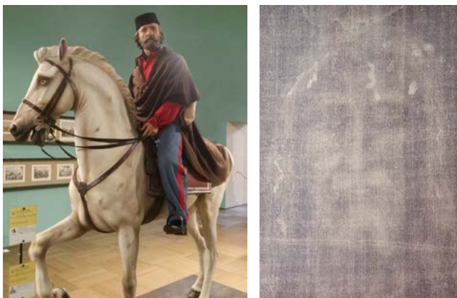
Left: Statue of Garibaldi, Italy's unifier, in the Turin national museum. Right: Jesus shroud displayed in the Turin cathedral.

Turin, located at the Po river, is the fourth largest Italian city and an important industrial site (e.g. automotive industry). The city is the capital of the Piedmont region and was the first capital of the modern Italy after the "Risorgimento" (regenesis) in 1861. The history of the regenesis of Italy is shown in the National Museum of the Italian Risorgimento. Turin presents itself with sophisticated architecture, typical Italian "piazas" and atmosphere, as well as many tourist attractions. The city is also known for its famous football club Juventus, winner of the European champions league and record winner of the Italian championship.